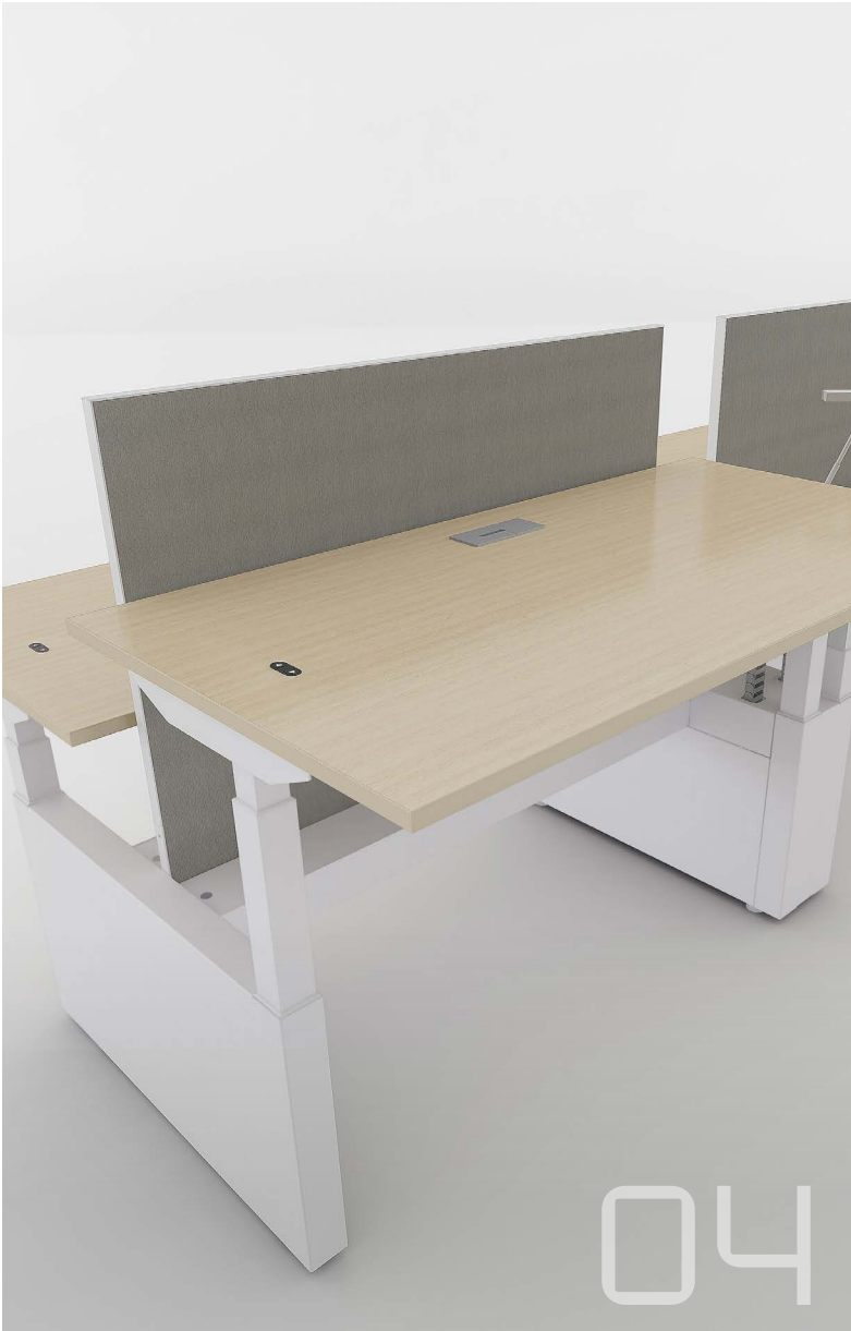
04 leg styles hiSpace offers an enclosed leg style with metal finish.