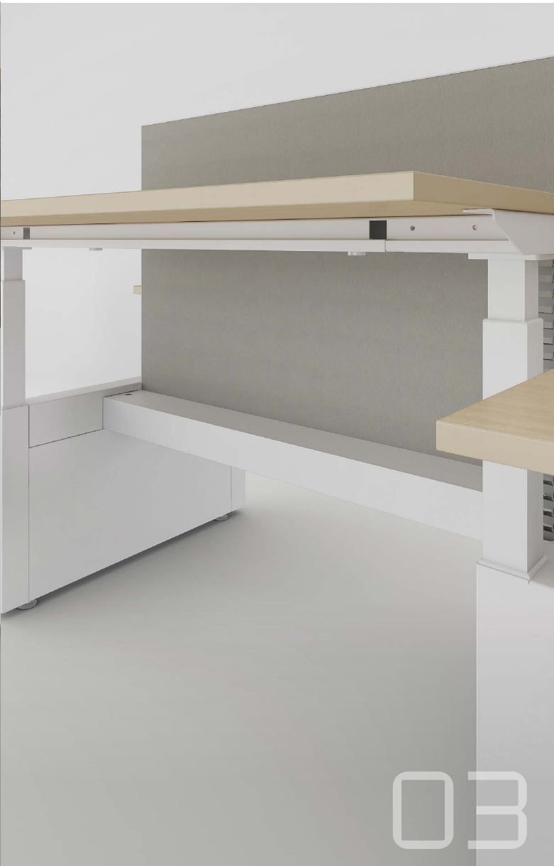
03 cable tray Integrated single cable tray to store and hide electrical and other data cables. Heavy-duty cable tray is also available as an option.