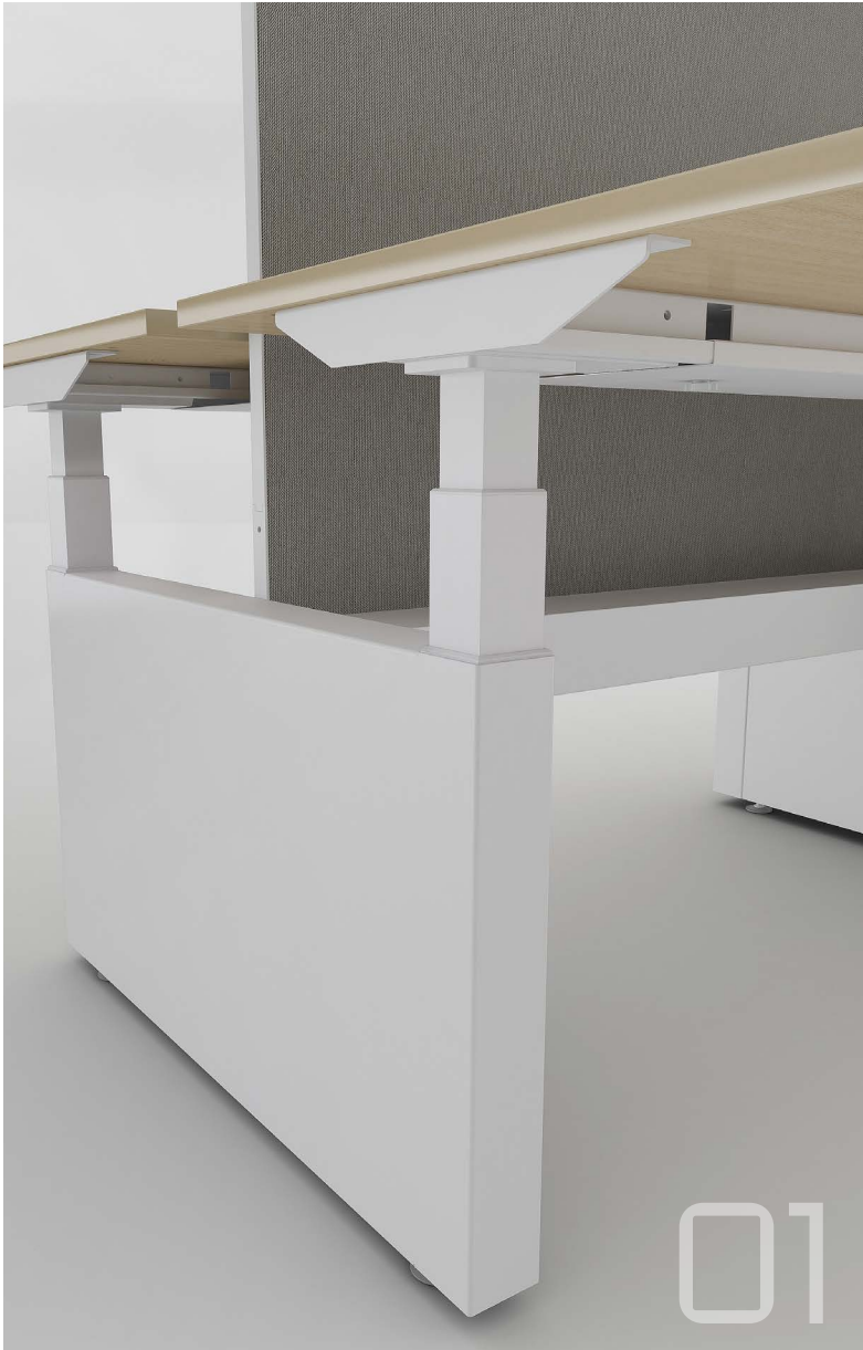
01 screens Fabric Screens ensure individuality and privacy from a user perspective.