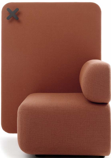
305SL NUGGET SCREEN LEFT