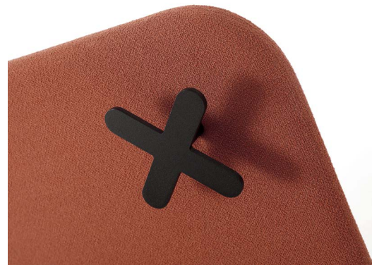
305X NUGGET X-HANGER