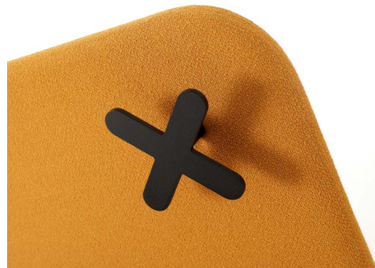
206X NUGGET X-HANGER