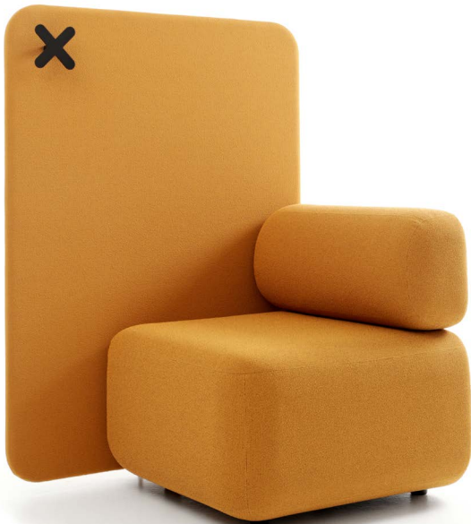
206SL NUGGET SCREEN LEFT