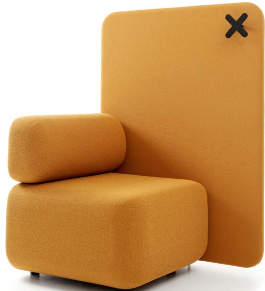
206SR NUGGET SCREEN RIGHT