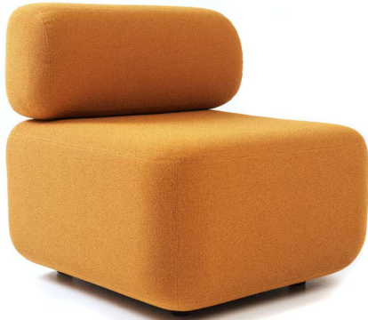
206 NUGGET CHAIR